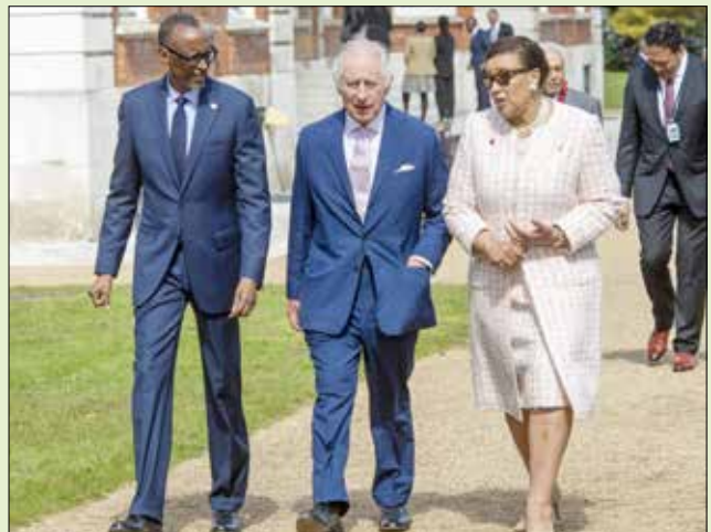
Commonwealth Leaders Meeting | London, 5 May 2023