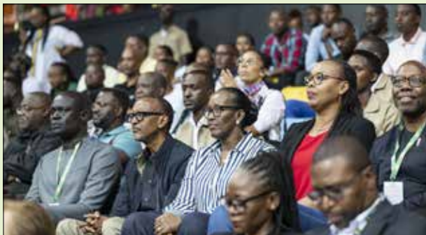
BAL Finals 2023 | Kigali, 20 May 2023