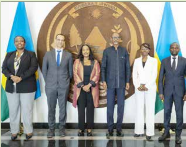
Meeting with Ms Pamela Coke-Hamilton, Executive Director of the International Trade Centre | Kigali, 9 May 2023