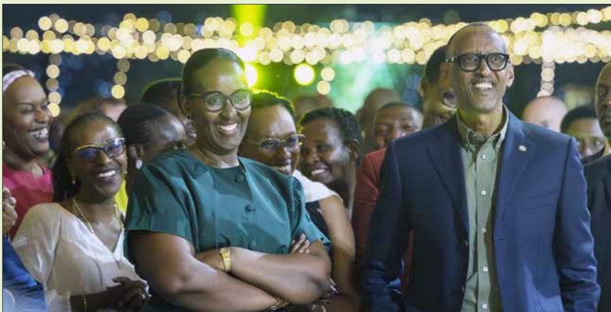
Kwibohora29 Party | Kigali, 2 July 2023