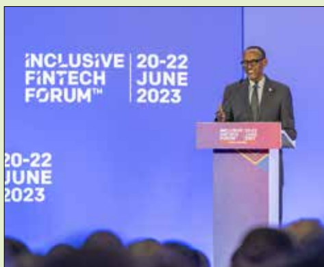
Inclusive FinTech Forum | Kigali, 21 June 2023