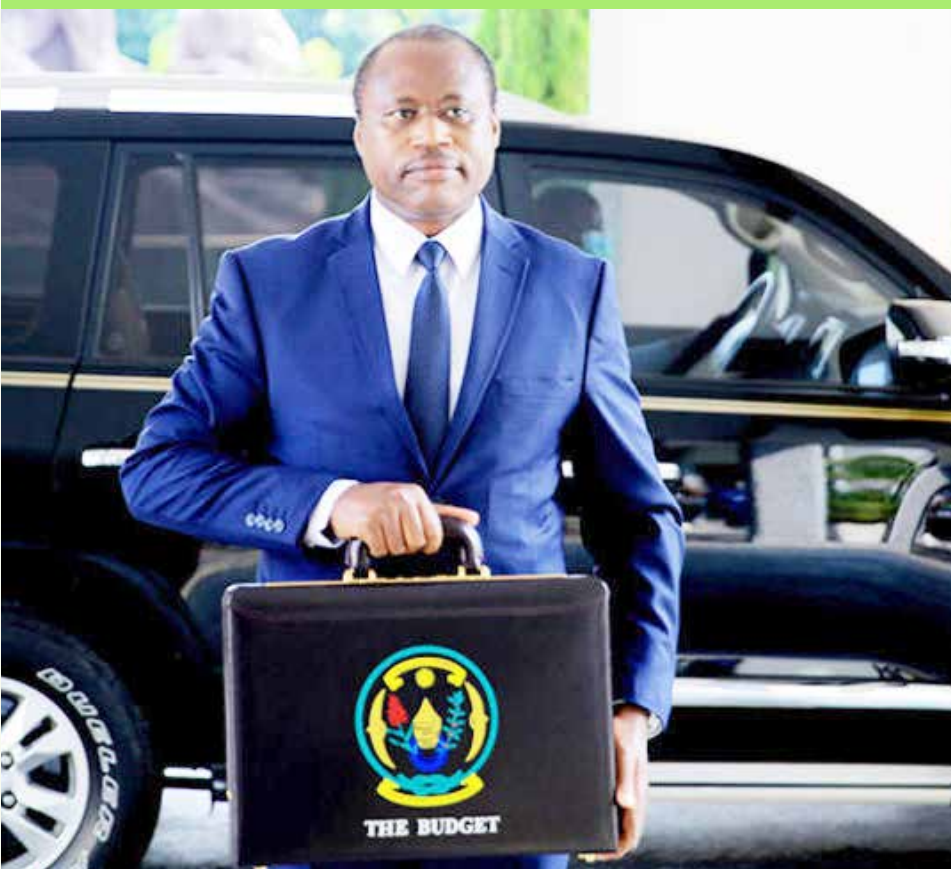
Dr. Uzziel Ndagijimana, Rwanda's Minister of Finance and Economic Planning