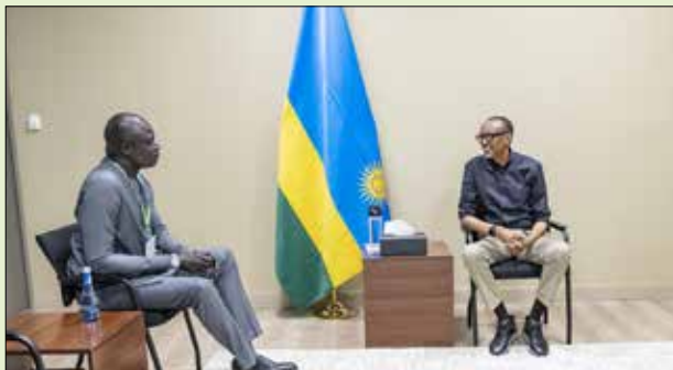
BAL Finals 2023 | Kigali, 20 May 2023