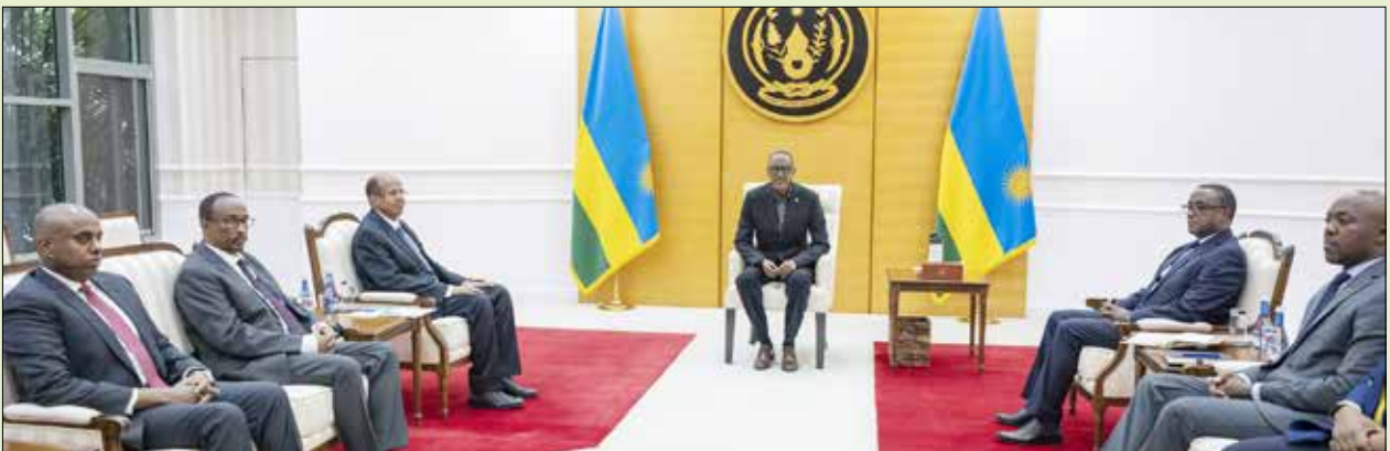
Meeting with Mahmoudi Ali Yousseuf, Djibouti Minister of Foreign Affairs and delegation | Kigali, 10 May 2023