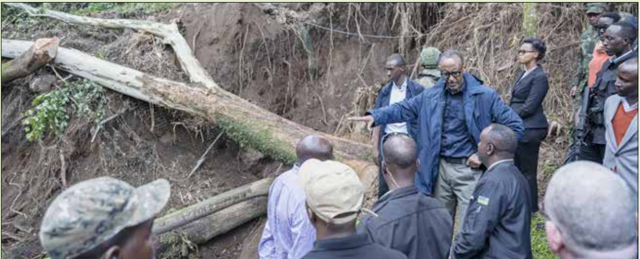
Visit to Rubavu District and Interaction with Residents affected by recent floods and landslides | Rugerero Sector, 12 May 2023