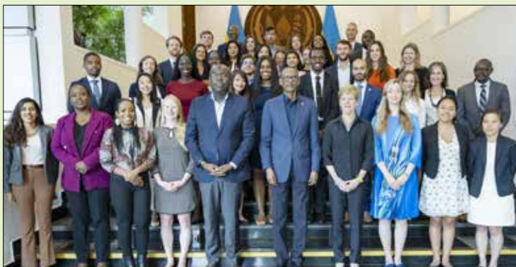
Meeting with Students and Faculty Members from Wharton School of Business, University of Pennsylvania | Kigali, 25 May 2023